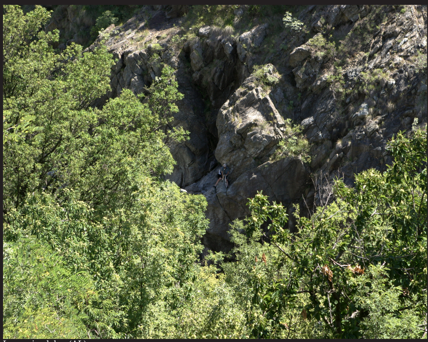
Lavagnina lakes (AL)